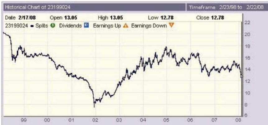
ZAR-USD over 10 years