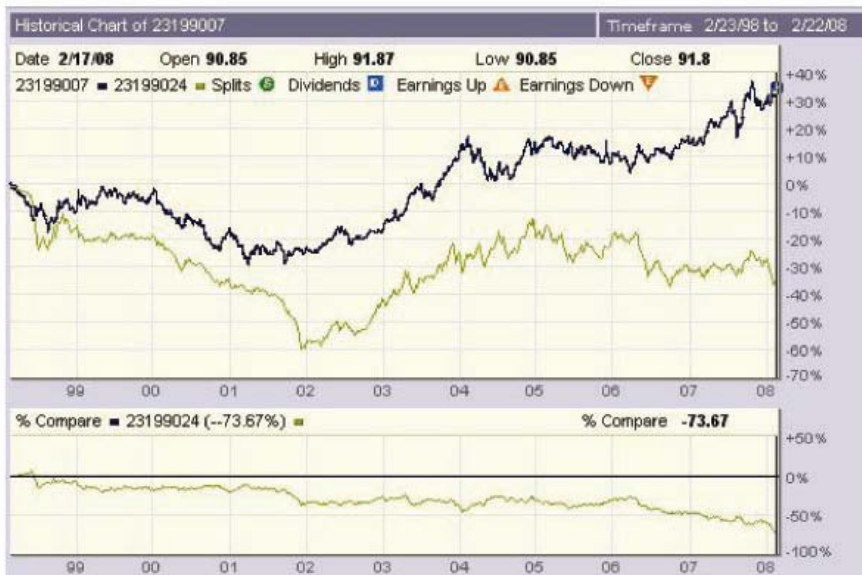
ZAR-AUD comparison over 10 years