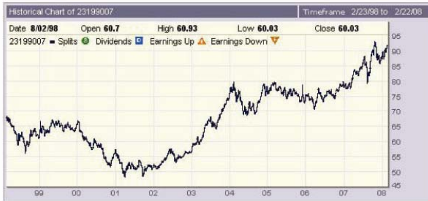
AUD-USD over 10 years